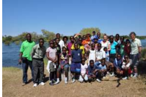
(a) On the Zambezi River cruise we saw elephants come close, drinking at the river edge. (b) By the Zambezi river.