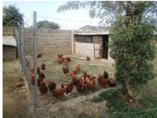
(a) New hammer mill fence to enclose security dogs. (b) New hen enclosure

Our other income generating activity is 100 laying hens; these were laying very well until recently when production dropped significantly due to lack of calcium and sunlight. (When we increased hen numbers last year, we bricked in their previous wire enclosure to provide shelter for them during the wet season). Thanks to GDG and the “Aussie Invasion”, money was provided for a wire enclosure so now the hens can play in the sun anytime without disturbing the vegetable garden. Egg production has come back to normal which means eggs for meals and for sale.