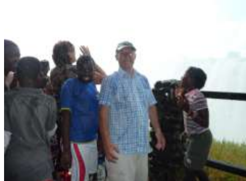
Drenched by the spray of the magnificent Victoria Falls (Zambia), one of the seven natural wonders of the world.