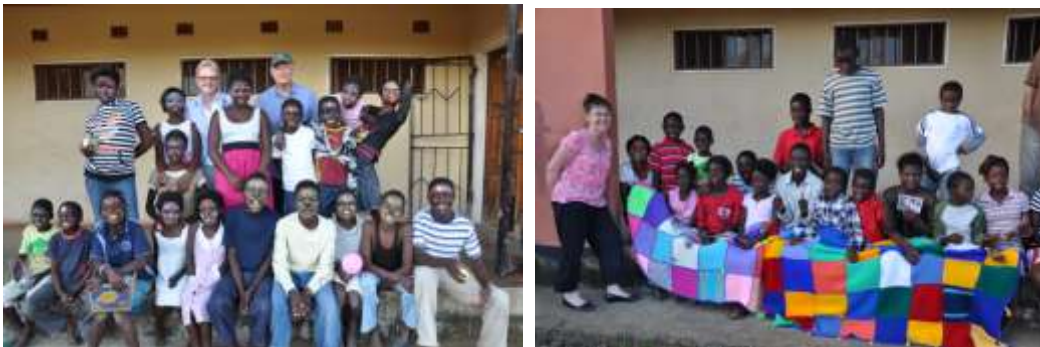
(a) Face painting (b) Hand knitted rugs, a gift from the aunts and children of New Beginnings Christian Church.

New Beginnings Children's Village was privileged to receive a team of seven Australians on the 2 nd April 2012 who stayed in Zambia for many weeks. It was such a memorable moment when the team arrived in Kafue the following day after resting because everyone was waiting anxiously to meet the new friends that we had never met before. The team did many activities at NBCV with the children and staff, which was a lot of fun and a great boost for their English language skills.